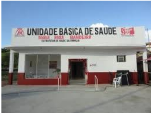
Primary Care Network (Belo Horizonte)