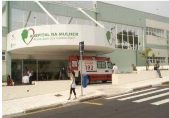
Hospital (Santo André)