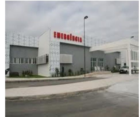
Suburbio Hospital (Bahia)