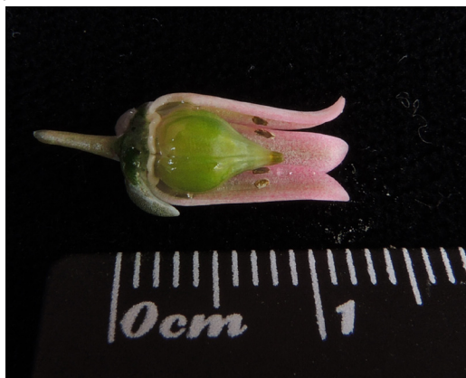
Figure 5. Carpels of Echeveria juliana .

its apparently closer relative, Echeveria tobarensis , by the size of the rosette, its pruinose leaf surface, light-pinkish leaf color, size of the inflorescence and the color and shape of the flowers, and color of the anthers, nectaries and gynoecium (see Table 1).