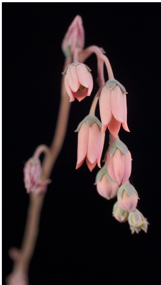
Figure 4. Echeveria juliana flowering in cultivation.