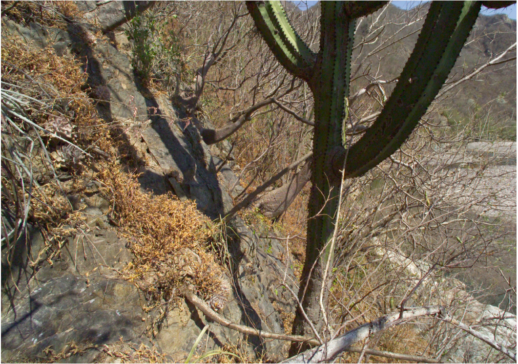
Figure 6. Echeveria juliana in habitat above Rio Piaxtla.

ft) altitude, whereas its recently rediscovered closest relative, E. tobarensis , grows at more than 2020 m (6630 ft) in pine forests (Etter & Kristen 2011). Unlike E. tobarensis , E. juliana does not tolerate low temperatures in cultivation. There are only a few echeverias known so far that grow below 1500 m (4920 ft) in the mountains of the Pacific slope: E. pallida Walther at 140 m (460 ft), E. laui Moran & Meyrán at 550 m (1800 ft), and E. acutifolia Lindley usually between 200 and 1000 m (660–3280 ft). Most of the Echeveria species are therefore found in temperate zones. E. juliana is the only species known so far in northwestern Mexico growing below 400 m (1310 ft).