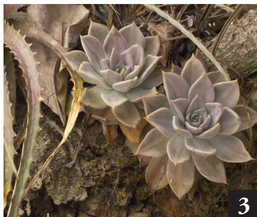
Figures 1–3. Echeveria juliana in habitat.