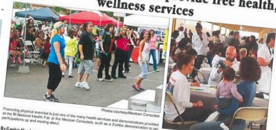
Promoting physical exercise is just one of the many health services and demonstrations provided at the Bi-National Health Fair at the Mexican Consulate, such as a Zumba demonstration to get participations up and moving about.