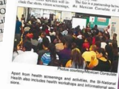
Apert from health screenings and activities, the Bi-National Health also includes health workshops and informational sessions.

Over 2,000 attended the 2012 Binational Health Fair at the Mexican Consulate in October 2012. This year organizers expect to serve even more people and provide a greater number of services.